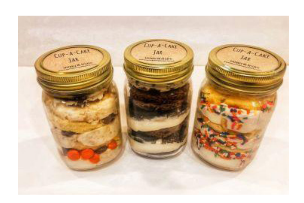
Cup-A-Cake in a Jar

4 2022 High School Students Business Competition 5