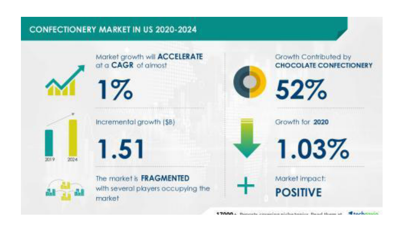
US Confectionery Market<sup>3</sup>