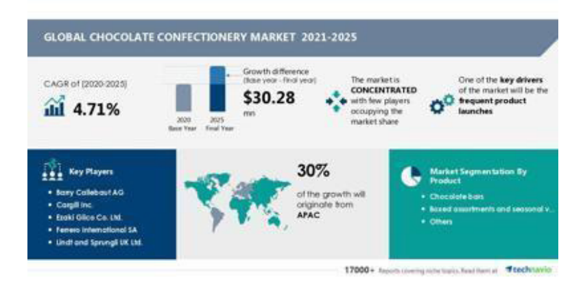
Global Chocolate Confectionery Market<sup>2</sup>

The goal of Sprinkle Me Desserts is to make our day as fun as possible. It works with local suppliers to procure fresh and authentic ingredients for candy and chocolates and uses backward-looking techniques to make sure producing high quality products. The local and global confectionary market situations are really conducive for candy manufacturing companies to improve their sales growth (see below pictures). Sprinkle Me Desserts is an e-commerce company, which means buying and selling of candies and confectioneries are taking place through internet and money and data are also transferred through internet. E-commerce is a perfect platform for companies to increase the visibility of their products and customers can purchase these products almost from any location if they have internet connection.